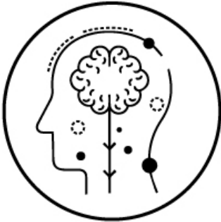
MENTAL HEALTH & THE BRAIN