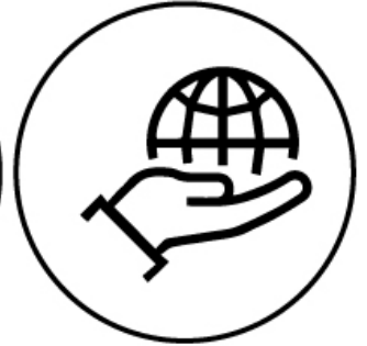
HEALTH IMPACTS ACROSS POPULATIONS