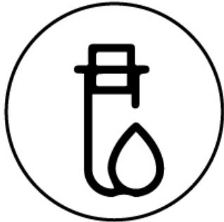
TESTING AND TREATING COVID-19

THE OFFICE OF THE VICE PRESIDENT FOR RESEARCH PARTNERED WITH THE IMMUNOLOGY, INFLAMMATION AND INFECTIOUS DISEASE (3I) INITIATIVE TO LAUNCH THE COVID-19 RESEARCH SEED GRANT PROGRAM. $1.3M WAS AWARDED TO 56 PROJECTS IN DIVERSE DISCIPLINES ACROSS CAMPUS.