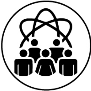
SOCIAL IMPACT & POLICY