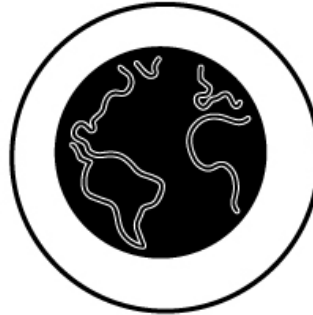
ENVIRONMENTAL IMPACT & MINIMIZING EXPOSURE